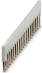
Plug-in bridge, pitch: 5.2 mm, number of positions: 20, color: gray

Please be informed that the data shown in this PDF Document is generated from our Online Catalog. Please find the complete data in the user's documentation. Our General Terms of Use for Downloads are valid ( http://phoenixcontact.com/download )